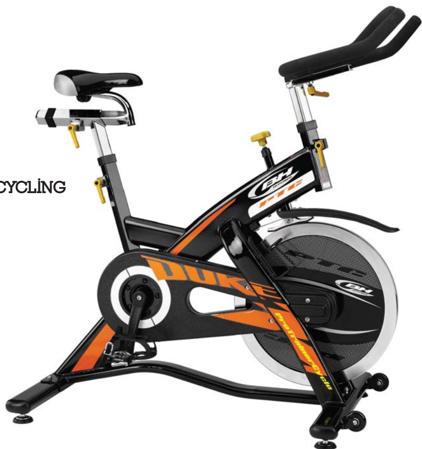
INDOOR CYCLING H920 Duke